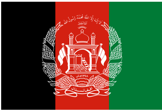
Flag of the Islamic Republic of Afghanistan, adopted August 19, 2013