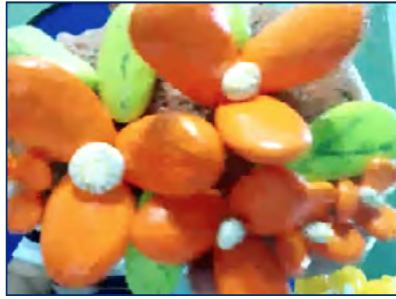
Screen shot: NETA Pecha Kucha

Marineti, who refers to herself as an artisan (“a skilled worker who makes things with her hands”), is based on Cape Cod. Whenever possible, she heads to the beach, where she gathers rocks of all shapes and sizes as well as some driftwood. Then in her workshop, she paints the rocks in a large range of colors and mounts them together, using special glue. Her output is extremely varied. She’ll produce diverse flowers or she’ll make a candle holder out of rocks. Some of her pieces are functional, others simply decorative. She displays them at crafts fairs.